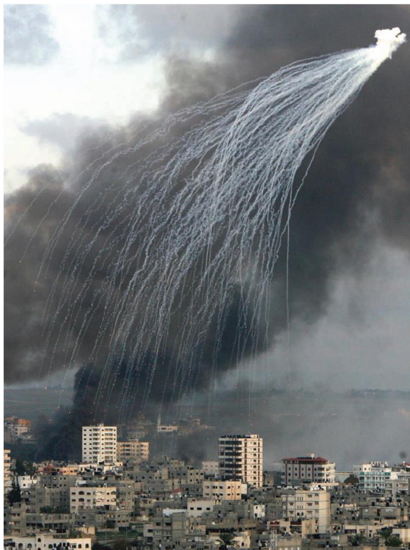
White phosphorus artillery is air-burst over Gaza during Operation Cast Lead. Each shell contains 116 felt wedges which can fall over an area up to 250 meters in diameter.