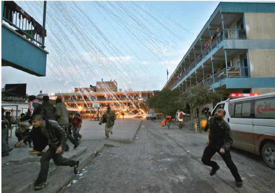
Two brothers aged four and five were killed and 14 others were wounded when white phosphorus shells burst above this UN school in Beit Lahiya on January 17, 2009.